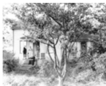
The Grow Family Homestead Still stands today as home to Harbour Public House