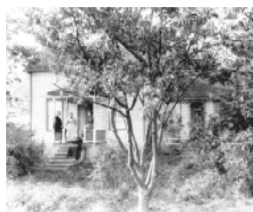
The Grow Family Homestead Still stands today as home to Harbour Public House